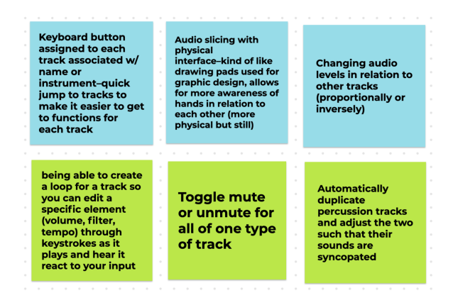
Figure 3: Designs from student brainstorming.

During the workshops, each participant generated an average of 4 designs and combined total of 42 (figure 3). We coded the ideas resulting in three types of projects. Information retrieval interfaces (IRIs) are systems that retrieve the state of multiple tracks without using the GUI. Example interfaces included new keyboard shortcuts and conversational interfaces. These interfaces were used to retrieve different information, such as volume levels, mute status, and track type. Task automation interfaces (TAIs) were the most common creation. TAIs reapplied IRI interfaces to automate complex tasks, such as applying effects to tracks, toggling mute, adjusting the volume, and providing shortcuts for actions. Command line interfaces (CLIs) were used as IRIs and TAIs. These systems were declared within a terminal, and they use a command + arguments format.